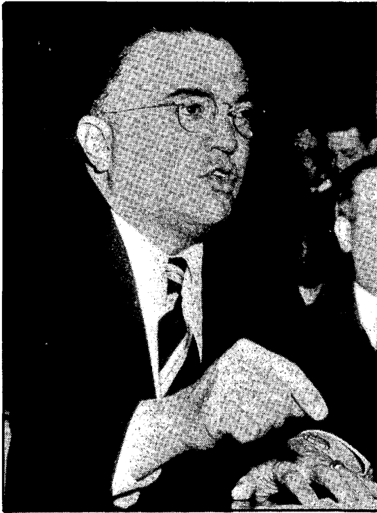
J. EDGAR HOOVER AS HE APPEARED BEFORE THE HOUSE UN-AMERICAN ACTIVITIES COMMITTEE.

J. EDGAR HOOVER MAKES STATEMENT CONCERNING MOTION PICTURE COMMUNISM.